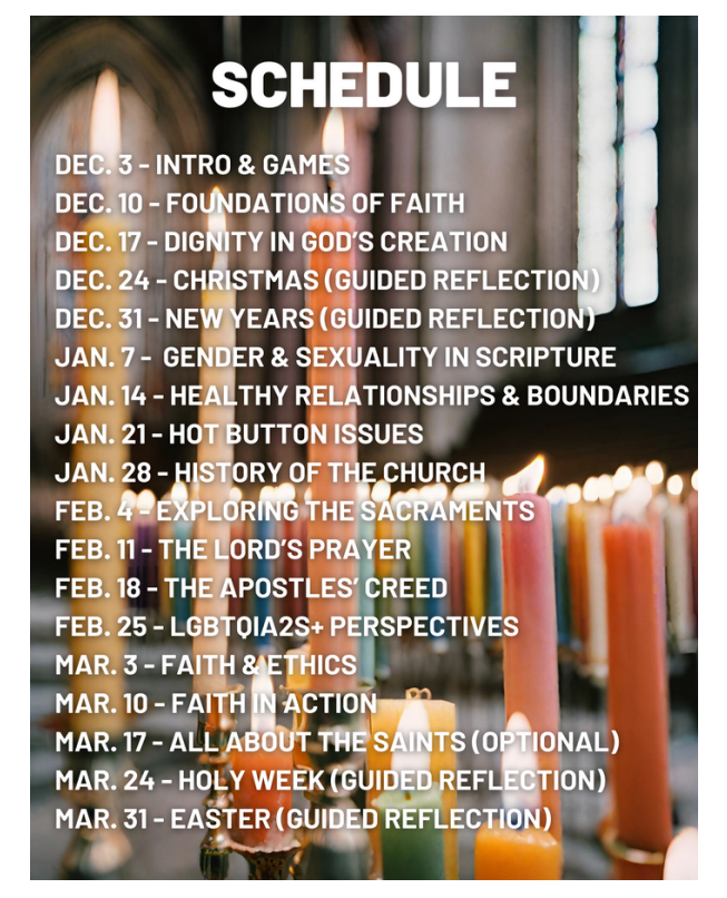
You can find our Discord Server at the link below!

Might miss a class or two? No worries! We'll get you caught up!